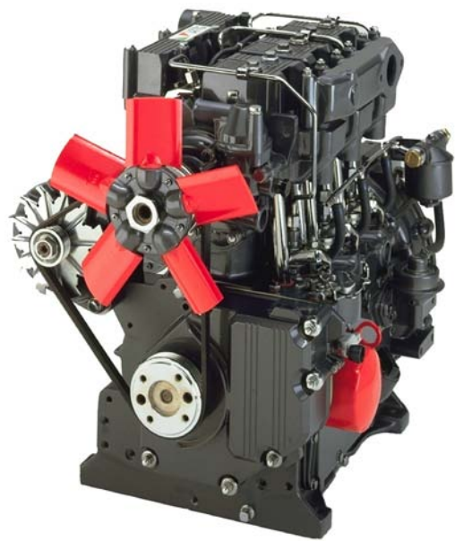
ALPHA SERIES ENGINE